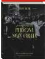
Photo Journalism & Essays

PERSONA NON GRATA: Bangkok What comes to mind when you think of Thailand? Many think: The Land of Smiles. Couldn't be further from the truth. Included here are photos of life in Bangkok, on the streets, a personal view. Fully illus. some in color. PowerHouse. 8½x11¼. Pub. at $45.00